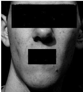
AP View of the Face