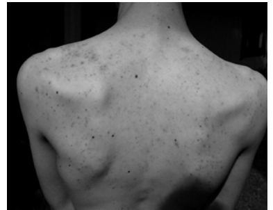
PA View of the Back