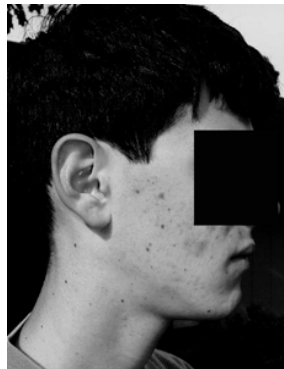
Right Lateral View of the Face